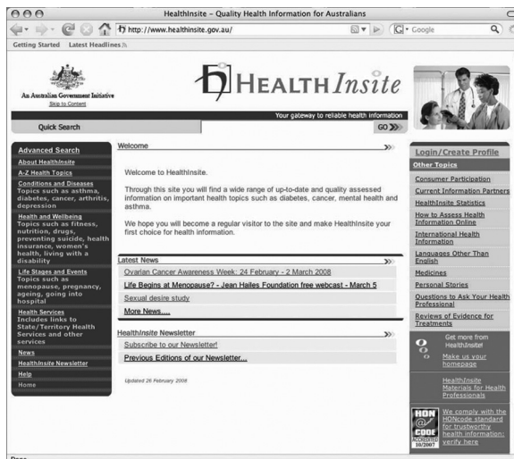
FIGURE 1. HealthInsite. Home Page

A search box appears at the top of the home page. Along the left-hand side, links to the advanced search forms and information about the organization itself appear, followed by an A–Z index of all topics, a diseases and conditions index, a list of general wellness topics (a catch-all for topics not listed elsewhere), information on life stages and events, and access to health services in Australia. Each of these selections is illustrated with examples, to help first-time users understand the structure of the site at a glance. This panel, which also includes links to the news, the newsletter, the help system, and the home page, appears at all times when the user remains on this site.